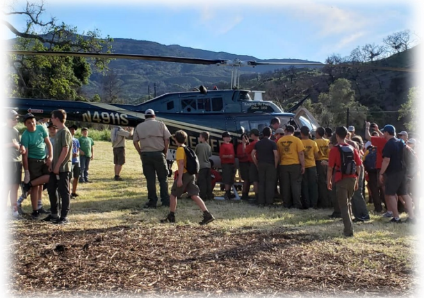
- Pacific Coast Camporee

Portland State University studies show children who have extensive outdoor experiences, especially English learning students, are more likely to show up to school, and afterward, are more confident at public speaking, more interested in volunteer opportunities, develop critical thinking skills and more likely to use conflict mediation skills with their peers.